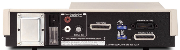
SR720 rear panel

Two rear-panel input connections are provided for an external bias voltage. Voltages as high as 40 VDC can be used. An optional handler interface provides control lines to a component handler for sorting. A standard RS-232 interface allows complete control of all instrument functions by a remote computer. A GPIB interface is included with the handler option.