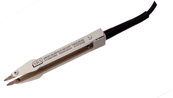
SR727 Surface Mount Tweezers

Two rear-panel input connections are provided for an external bias voltage. Voltages as high as 40 VDC can be used. An optional handler interface provides control lines to a component handler for sorting. A standard RS-232 interface allows complete control of all instrument functions by a remote computer. A GPIB interface is included with the handler option.