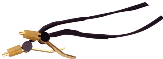
SR726 Kelvin Clips

The SR715 and SR720 support three types of binning schemes: pass/fail, overlapping and sequential. Pass/fail has only two bins: good parts and everything else. Overlapping (or nested) bins have one nominal value and are sorted into